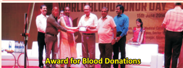
Award for Blood Donations