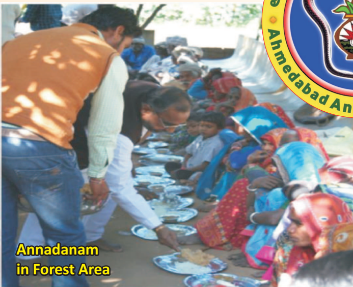
Annadanam in Forest Area