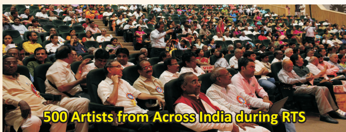
500 Artists from Across India during RTS