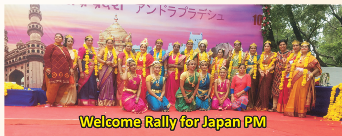
Welcome Rally for Japan PM