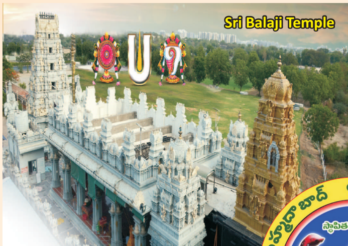
Sri Balaji Temple