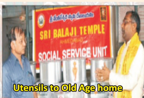
Utensils to Old Age home