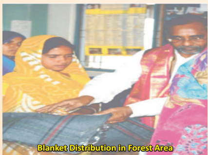
Blanket Distribution in Forest Area